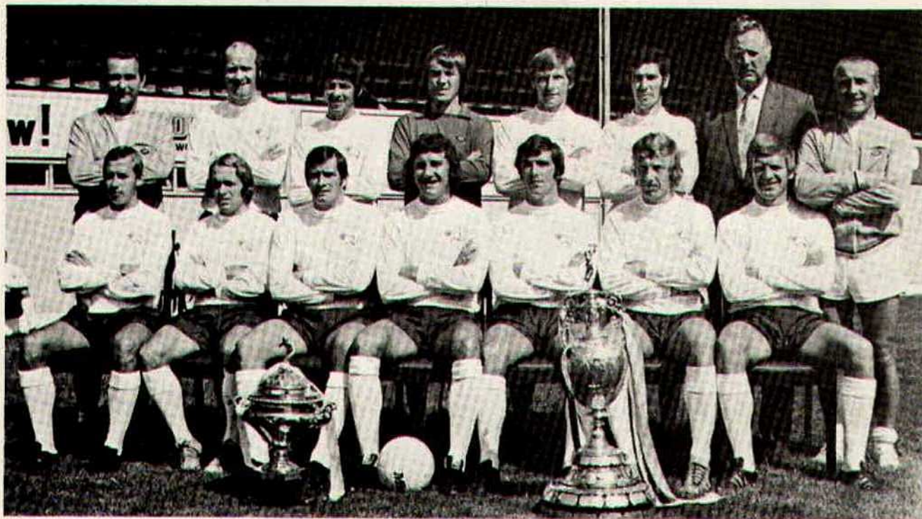
Back row (left to right): Brian Clough, Terry Hennessey, Ron Webster, Colin Boulton, Colin Todd, John Robson, Peter Taylor (Assistant Manager), Jimmy Gordon (Trainer). Front row (left to right): John McGovern, Archie Gemmill, John O'Hare, Roy McFarland (captain), Alan Hinton, Alan Durban.